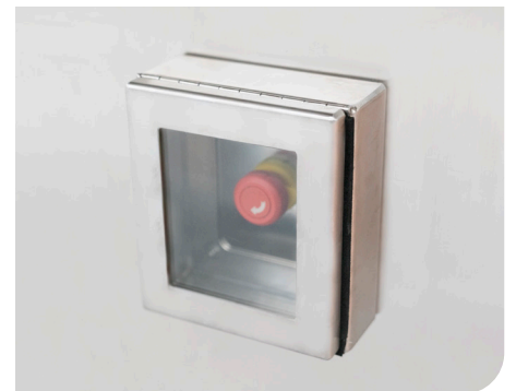
E-STOP PROTECTIVE COVER