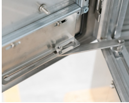
DOOR STAY - 316L