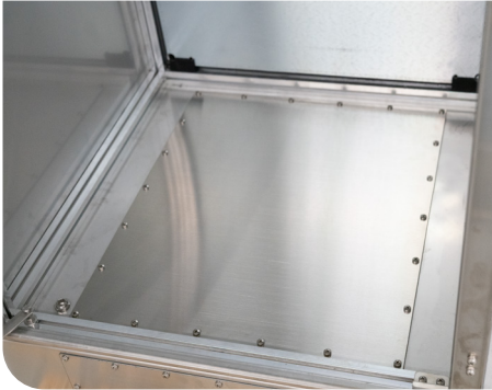
REMOVABLE GLAND PLATE