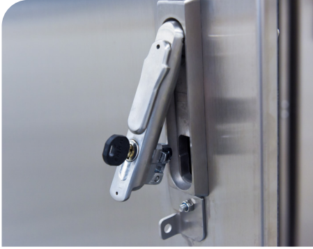
316L SWING HANDLE