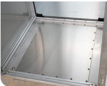
19" RACK SYSTEM